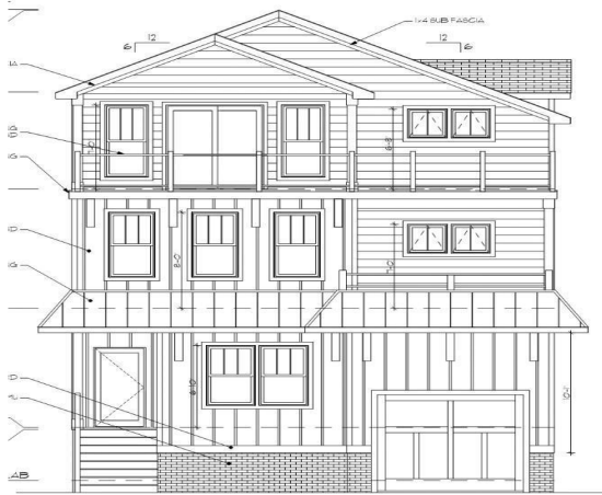
1 FRONT ELEVATION SCALE: 1/4" = 1'-0"