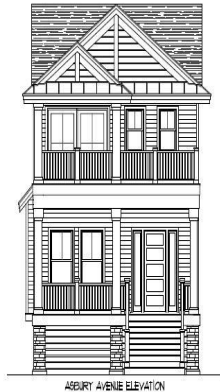
WORKING PLANS July 22, 2025