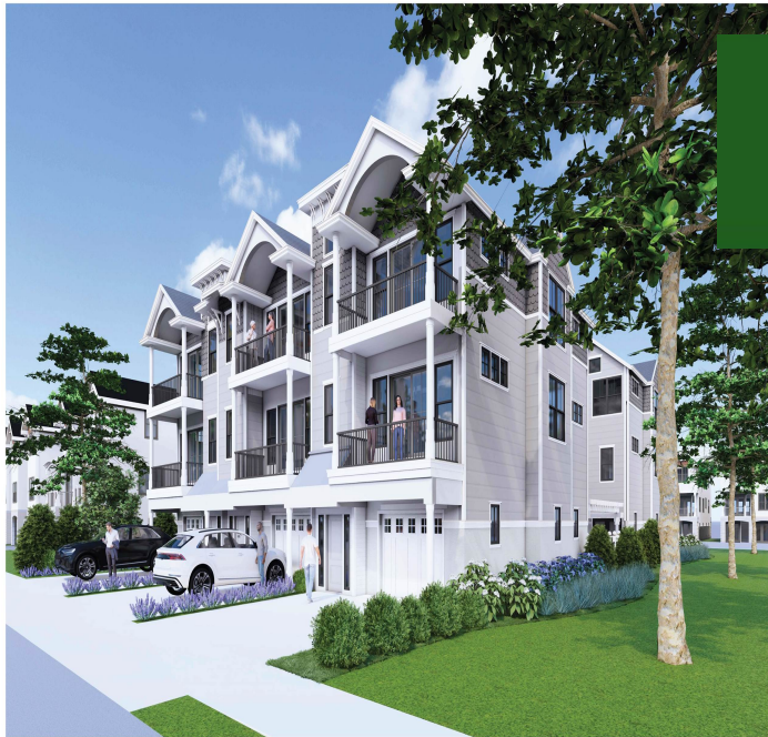
1 VIEW LOOKING NORTH EAST SCALE: NO SCALE